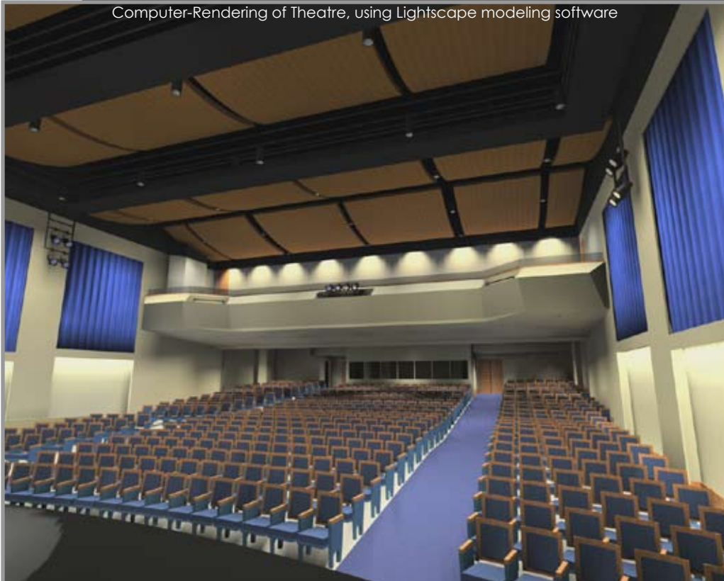
Computer-Rendering of Theatre, using Lightscape modeling software

Our role in the renovation of this theatre was to design a stage and house lighting system, DMX digital data and distribution network for future special effects lighting, stage rigging system, specify a pit filler system, and assist with catwalk design.