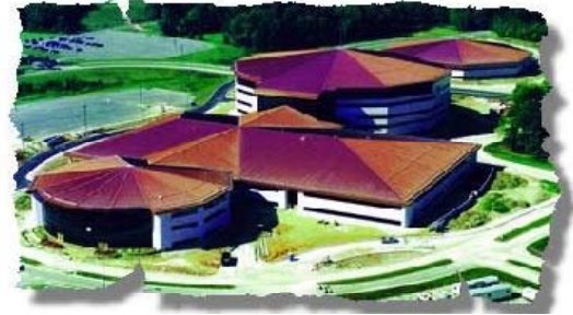
Artist's rendering of church exterior