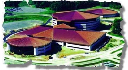
Artist's rendering of church exterior